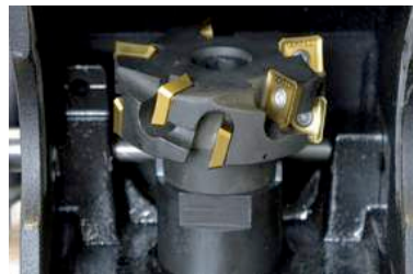
Mono block milling head, with 10 indexable inserts fixed with screws.