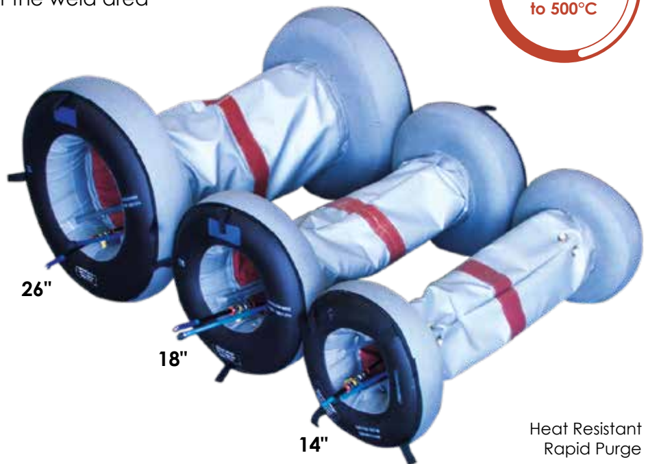
Heat Resistant Rapid Purge

e.g. 36" Pipe will purge in less than 10 minutes!