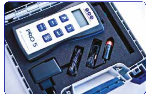
Supplied in a durable carry case